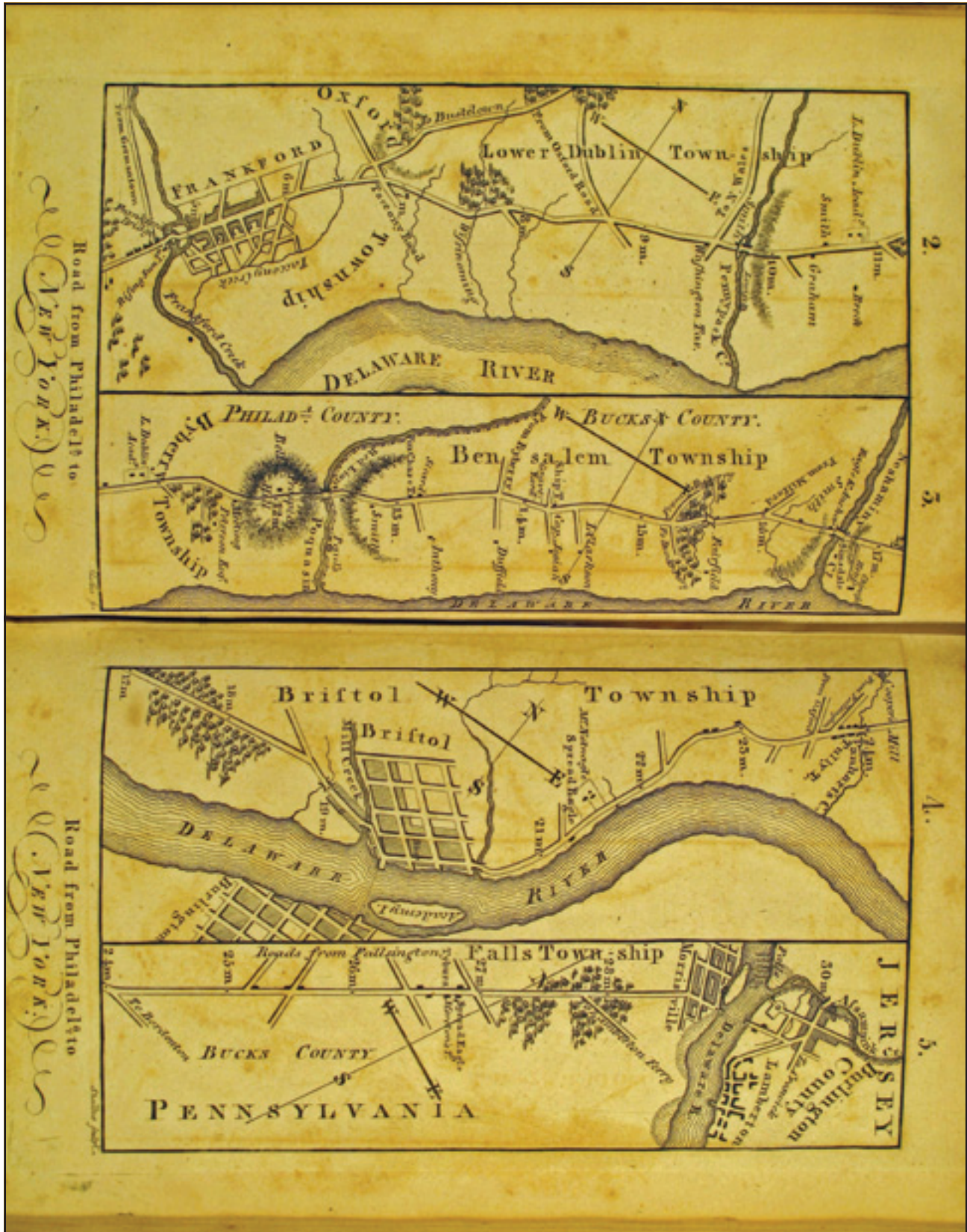
Figure 2. Four strips from 1804 "Traveller's Directory ... Philadelphia to New York." Note the dearth of information compared to "Britannia Depicta" which was many decades older.