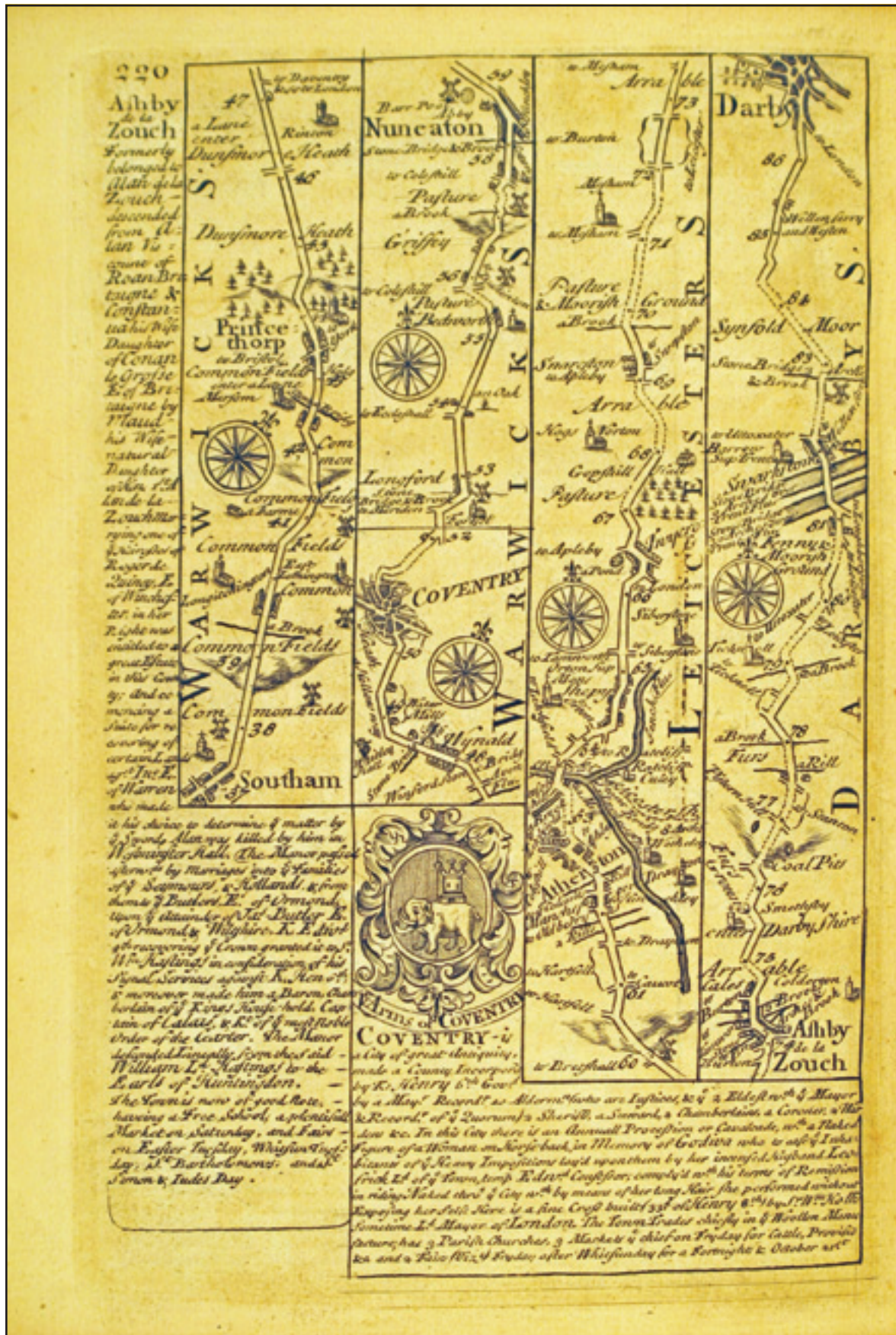
Figure 1. Page from 1750 "Britannia Depicta," describing Lady Godiva's ride.